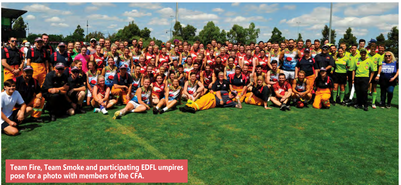
Team Fire, Team Smoke and participating EDFL umpires pose for a photo with members of the CFA.