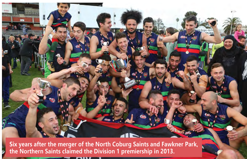
Six years after the merger of the North Coburg Saints and Fawkner Park, the Northern Saints claimed the Division 1 premiership in 2013.

Under 18 Division 1 (Previously Under 17/18 Division 2) 1963 Keilor 1964 Strathmore 1965 Ascot Vale Presbyterians 1966 Aberfeldie 1967 Brunswick City 1968 Ascot Vale 1969 Brunswick City 1970 Moonee Valley 1971 East Keilor 1972 Tulla. Ascot Presbyterians 1973 Moonee Imperials 1974 Keilor 1975 Airport West 1976 Moonee Imperials 1977 Riverside Stars 1978 Oak Park 1979 East Brunswick 1980 Tullamarine 1981 Coburg Districts 1982 Coburg Districts 1983 Tullamarine 1984 East Keilor 1985 Glenroy 1986 Keilor Park 1987 Keilor Park