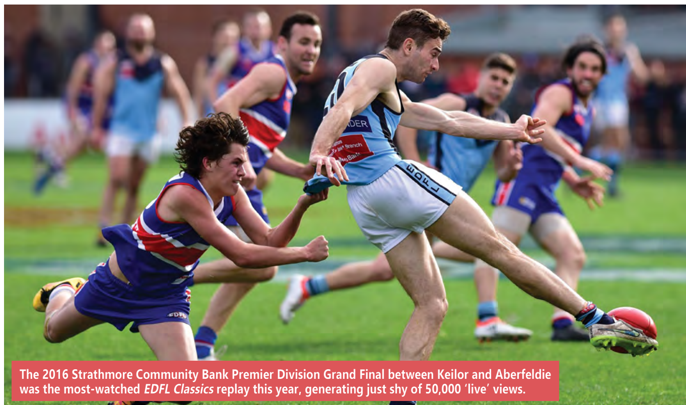
The 2016 Strathmore Community Bank Premier Division Grand Final between Keilor and Aberfeldie was the most-watched EDFL Classics replay this year, generating just shy of 50,000 'live' views.