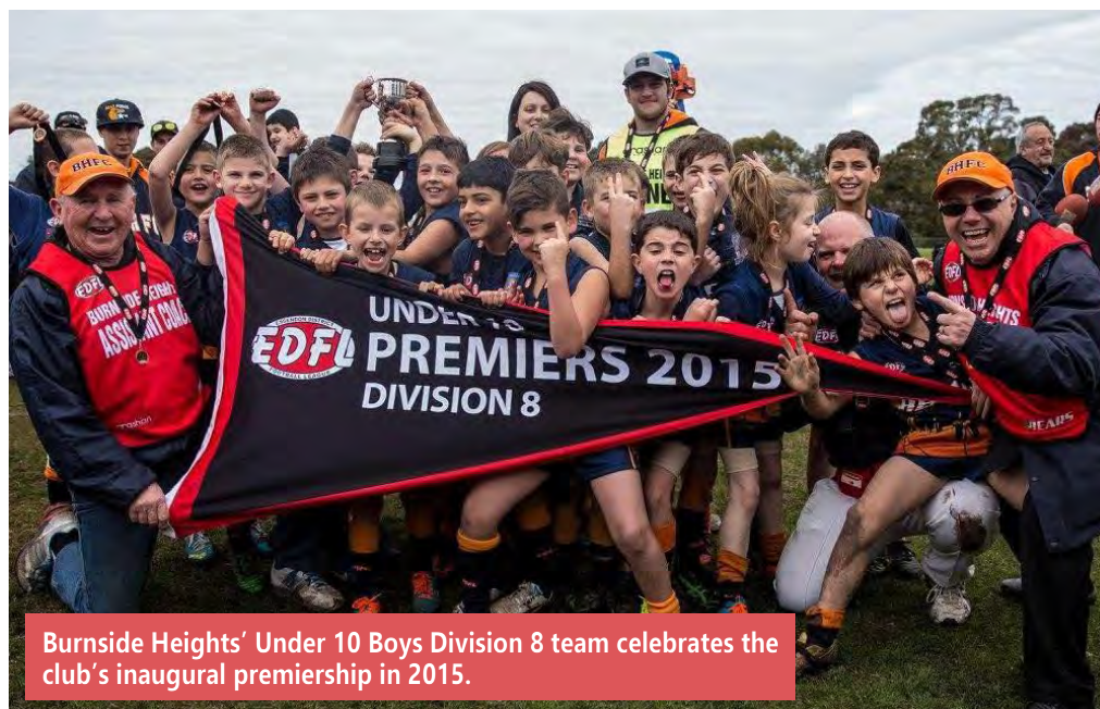
Burnside Heights' Under 10 Boys Division 8 team celebrates the club's inaugural premiership in 2015.