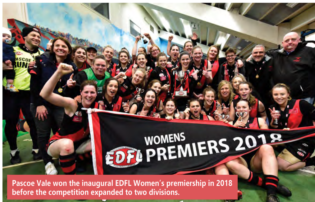
Pascoe Vale won the inaugural EDFL Women's premiership in 2018 before the competition expanded to two divisions.

1966 Airport West 1967 Oak Park 1968 Avondale Heights 1969 Ascot Presbyterians 1970 Aberfeldie 1971 West Essendon 1972 Airport West 1973 Riverside Stars 1974 Riverside Stars