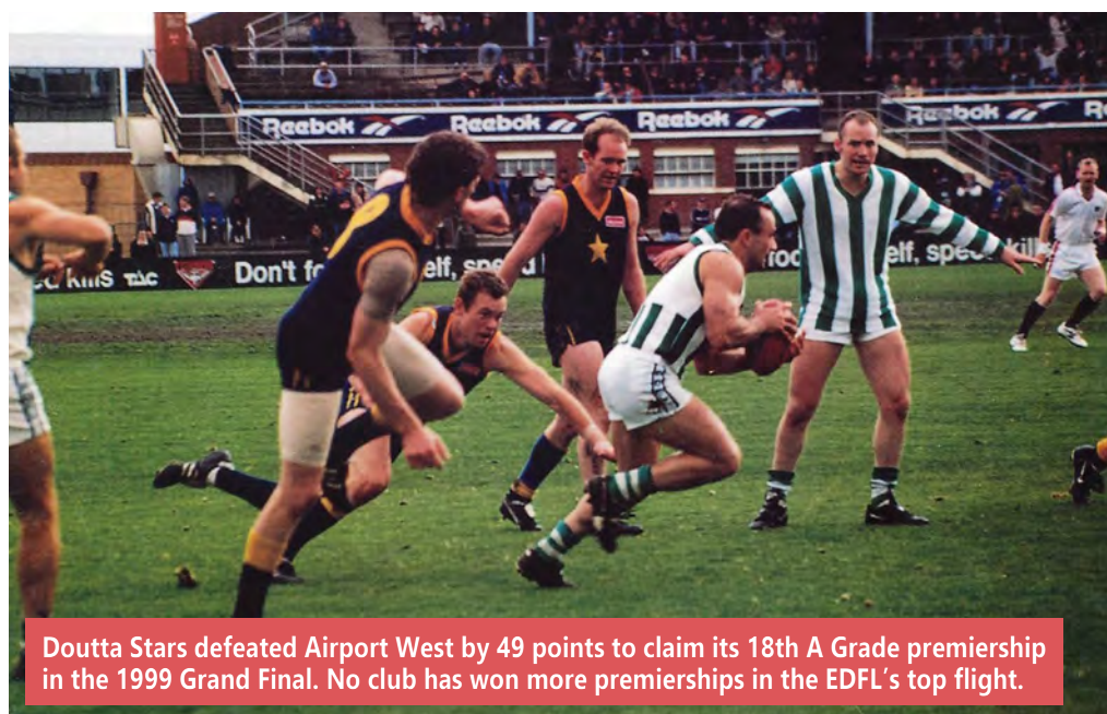
Doutta Stars defeated Airport West by 49 points to claim its 18th A Grade premiership in the 1999 Grand Final. No club has won more premierships in the EDFL's top flight.

1936 Essendon Sons of Soldiers 1937 Brunswick City 1938 Brunswick City 1939 Essendon Imperials 1940 Coburg Sons of Soldiers 1948 Moonee Imperials 1949 Essendon Bombers 1950 Lincoln Stars 1951 Aberfeldie 1952 Moonee Imperials 1953 Doutta Stars 1954 Ascot Youth Centre 1955 Doutta Stars 1956 Essendon Baptist St John's 1957 Essendon Baptist St John's 1958 Nth. Essendon Methodists 1959 Essendon Baptist St John's 1960 Essendon H.S. Ex-Students 1961 Essendon Baptist St John's 1962 Doutta Stars 1963 Footscray Tech College 1964 Doutta Stars 1965 Essendon H.S. Ex-Students 1966 Essendon H.S. Ex-Students 1967 Doutta Stars 1968 Essendon Baptist St John's 1969 Essendon Baptist St John's 1970 Strathmore 1971 Doutta Stars 1972 Doutta Stars 1973 Glenroy 1974 Avondale Heights 1975 East Keilor 1976 Strathmore 1977 Strathmore 1978 Glenroy 1979 Glenroy 1980 Airport West 1981 Avondale Heights 1982 Moonee Valley 1983 Hadfield