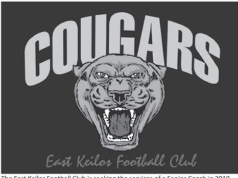
The East Keilor Football Club is seeking the services of a Senior Coach in 2019.

The club is at an exciting point in its future having consolidated in Division 1. With an excellent crop of U/15's to come through to senior level in 2019 we have excellent depth and are looking for a quality individual to continue the platform that has been building since 2013.