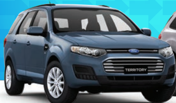
TERRITORY MKII TX RWD

OR FREE SCHEDULED SERVICING FOR UP TO THREE YEARS*