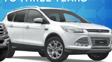
FORD KUGA TREND PETROL

2.0L EcoBoost Engine • 6-speed auto • Ford SYNC® 2 Connectivity System** • Rear View Camera