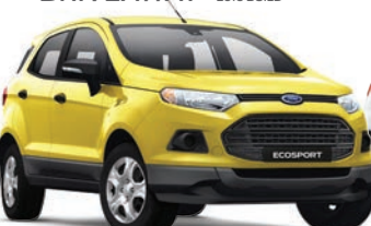
ECOSPORT AMBIENTE MANUAL

1.5L petrol with manual transmission • Bluetooth® with voice control • iPod™ and USB integration