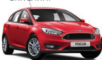
FOCUS TREND HATCH

6 speed manual • Ford SYNC® 3 Connectivity System*** including AppleLink™, Apple CarPlay™ and Android Auto™ Integration*