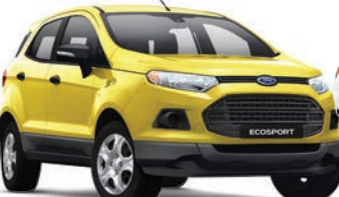
ECOSPORT AMBIENTE MANUAL

1.5L petrol with manual transmission • Bluetooth® with voice control • iPod™ and USB integration