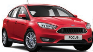
FOCUS TREND HATCH

6 speed manual • Ford SYNC® 3 Connectivity System*** including AppleLink™, Apple CarPlay™ and Android Auto™ Integration*