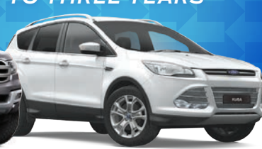
FORD KUGA TREND PETROL

2.0L EcoBoost Engine • 6-speed auto • Ford SYNC® 2 Connectivity System** • Rear View Camera