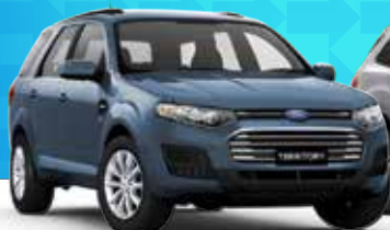
TERRITORY MKII TX RWD

OR FREE SCHEDULED SERVICING FOR UP TO THREE YEARS*