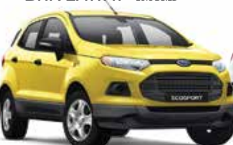
ECOSPORT AMBIENTE MANUAL

1.5L petrol with manual transmission • Bluetooth® with voice control • iPod™ and USB integration