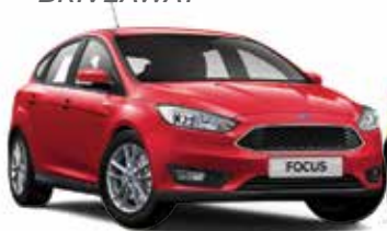
FOCUS TREND HATCH

6 speed manual • Ford SYNC® 3 Connectivity System*** including AppleLink™, Apple CarPlay™ and Android Auto™ Integration*