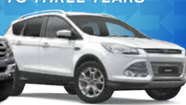
FORD KUGA TREND PETROL

2.0L EcoBoost Engine • 6-speed auto • Ford SYNC® 2 Connectivity System** • Rear View Camera